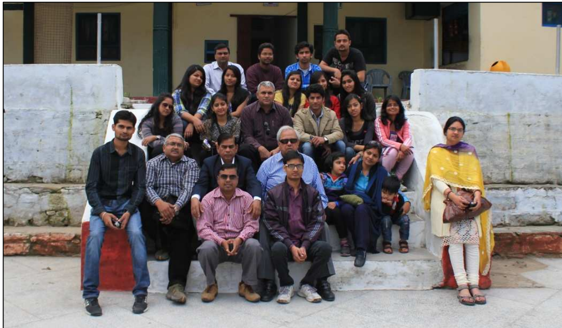
AGS Field Visit to Lansdowne, March 2013